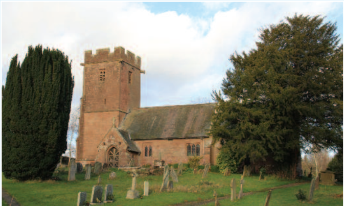
St David's, Little Dewchurch (Walk 1)

On Sundays buses depart from Peterstow (Post Office) to Hereford at 1101, 1301, 1501, 1701 and 1901.