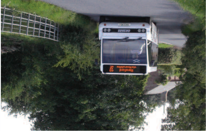
Bus 37 en-route to Hereford

The 37 bus from Hereford to Ross-on-Wye follows an old turnpike road dating from the 18th century, by way of the Area of Outstanding Natural Beauty. From Hereford the bus climbs between the wooded hills of Dinedor (on the left) and Aconbury (on the right), crowned with ancient hillforts both of which are short walks from this bus route. You will also catch sight of Aconbury St John the Baptist Church on the right. It is thought to have been part of 13th century priory so there would have been a much larger settlement here in medieval times. There are also good views across the Wye Valley to the Woolhope Dome on your left and to the Garway Hills on the right as the bus makes its way to Little Dewchurch where it often pauses awhile by the village green. The next village is Hoarwithy, sheltered by wooded slopes and where the Wriggles Brook flows into the River Wye. Look out for St Catherine's Church on the right as the bus descends