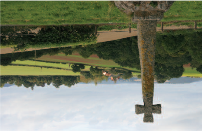
The old cross at Peterstow