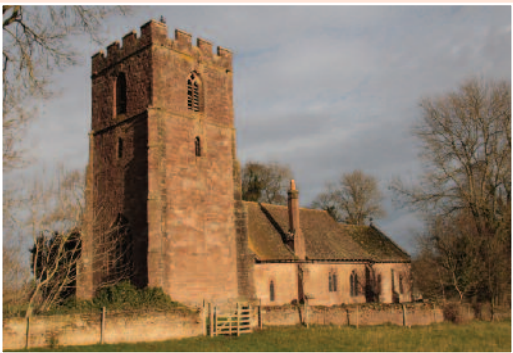
St Dubricius Church, Hentland