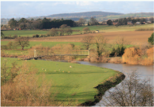
Sellack Bridge over the Wye